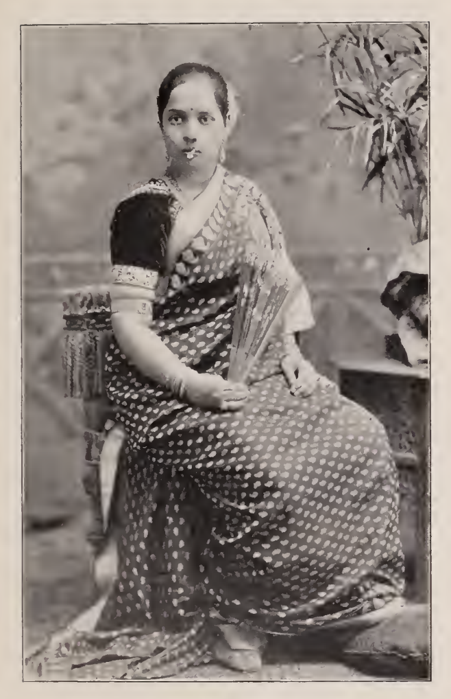
A Wealthy High-caste Zenana Lady of Bombay